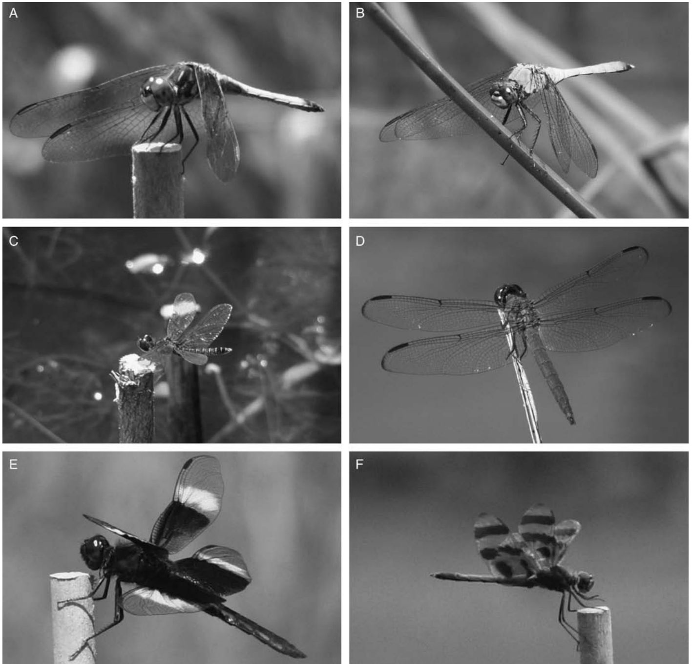
Figure 1. Common perching dragonflies: (A) Blue Dasher, (B) Common Pondhawk, (C) Eastern Amberwing, (D) Slaty Skimmer, (E) Widow Skimmer, and (F) Halloween Pennant.